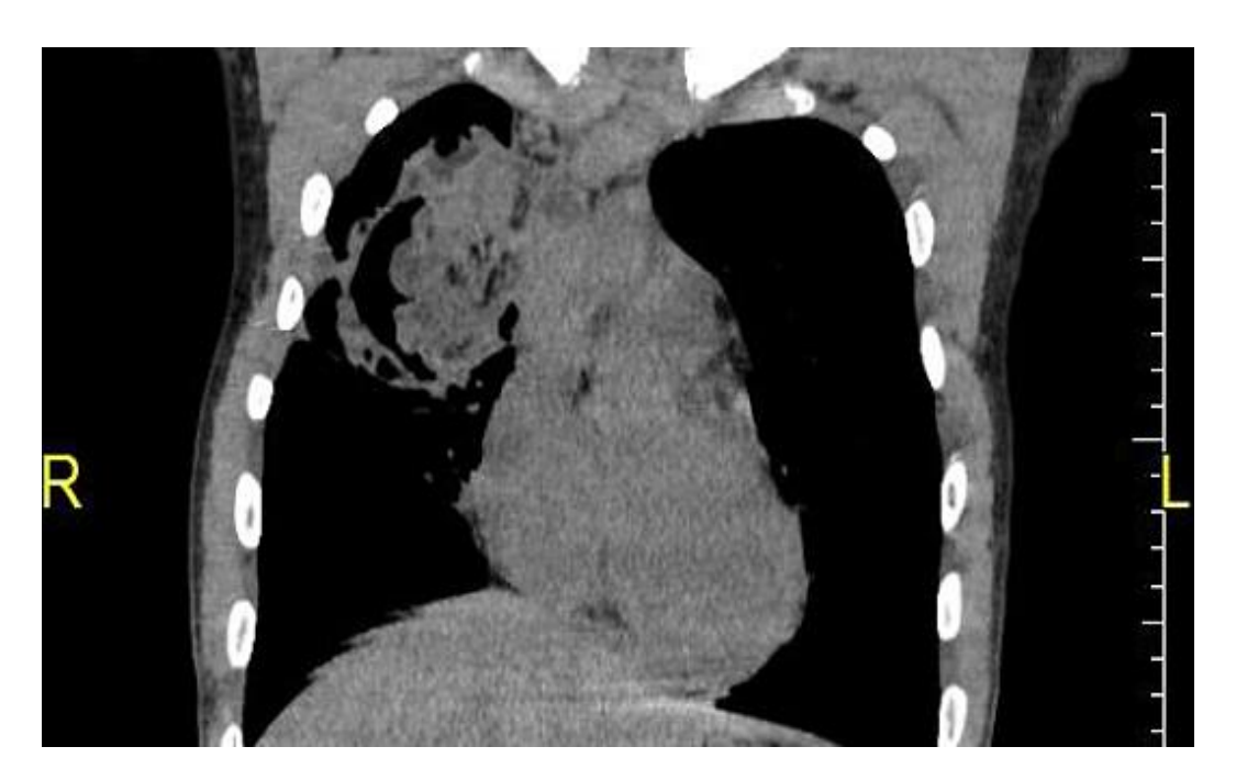
Figure 1. Cystic mass with irregular margin (6,9x7,5x6,8 cm) with semisolid (21-30HU) and calcification (160HU) component with air crescent sign in anterior apical lobe right lung (RSDS Radiology Dept, 2017)

A 19-year-old man came to Dr. Soetomo Hospital with shortness of breath three months before. The other clinical signs were coughing up blood with hair and teeth. There was no fever. The patient stopped coughing up blood after consuming tranexamic acid.