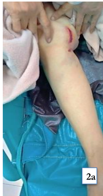
Figure 2 a,b. Local Examination on regio cruris sinistra patient. We found open fracture on cruris regio.