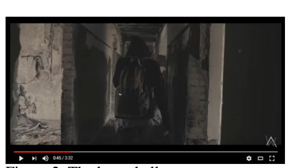
Figure 2. The househallway

The modification is done not only by changing the music by using a set of gamelan, but it is done by modifying the narration. The narration modification is performed by deleting not only the original lyric but also the original visual images in Alan Walker's Faded. The deletion then results in new lyrical and visual artistic elements which form a set of a new narration illustrating Javanese viewpoint upon the certain issue.