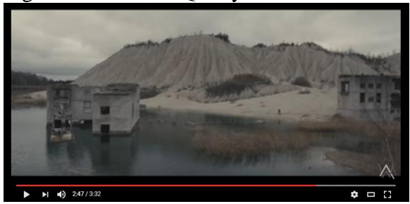
Figure 5b. Rummu Quarry

Figure 5a and 5b above are Rummu quarry images which actually picturize the damaged environment. People leave and abandon the Rummu and its vicinity soon as they noticed that the nature could no longer give them the priceless limestone. Moreover, the site is only functioned as the spoil tip. Consequently, Rummu and its vicinity are becoming the dog-eared sites. In shorts, those places are the shadow over the light meaning that those sites signify the dark side of the human exaggerated economic activity and human improper environmental treatment.