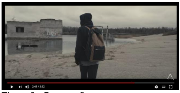
Figure 5a. Rummu Quarry