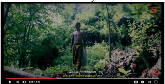
Figure 7. Abandonment suffered by man (Gamelawan at 1:15 minutes)

Through their work, Gamelawan reaffirms the concept of abandonment. Unlike Alan Walker who puts his attention of environmental abandonment, Gamelawanput their more concern of the abandonment suffered by man.