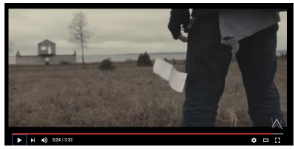
Figure 6b. Destroyed house

Figure 6a above is highlighting the nostalgic memory deals with the 'house' condition. Before the invention of mining and other exploitative activity, the environment is clearly in good condition. Contrariwise, the pristine and well-maintained environment is gradually devastated as the human comes to exploit the environment which then leads tothe terrible 'house' loss. The figure 6b is illustrating how the man is losing his hope to find the well-maintained house. The great loss is illustrated in the figure 6b as the man find the house faded like the Atlantis.