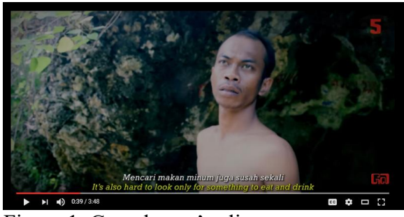
Figure 1. Gamelawan's clip

By seeing the above-mentioned table, it is immediately apparent that Gamelawancreates their creative response by modifying the lyrics and the narration. The modification is done due to the audience segment consideration. Gamelawan is targeting Javanese audiences in particular and Indonesians in general. The Indonesian translation in their video clip allows the audiences, in general, understand the lyrics as well as the narration that Gamelawan is promoting.