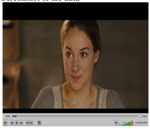
Datum (1 - 00:4:46 - 00:4:56 - S)