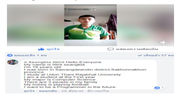
Figure 2. An example of individual work on Facebook (closed group)