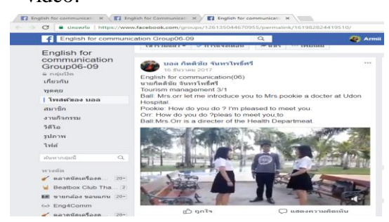
Figure 1. An example of pair work or working in groups of three on Facebook (closed group)

a. Work in pairs or groups of three depending on the given situation. For example, the task called "Introducing Oneself" is used to start the class. The students need to learn to ask for basic information using questions prepared by the teachers, e.g. "What is your name?" "What do you do in your free time?" Then, the students need to use this information to tell their story and make a video.