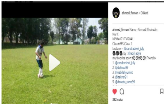
Figure 3. The student's assignment in Instagram