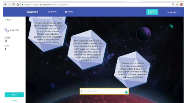
Figure 12(b). Gravity interface

Gravity is one of game-mode in Quizlet. In this study mode, definitions scroll vertically down the screen in the shape of asteroids. The user must type the term that goes with the definition before it reaches the bottom of the screen.