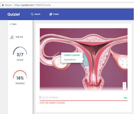
Figure 8. Write mode showing the answer to the students

Once the right answer pops up, the students can copy the answer to the box.