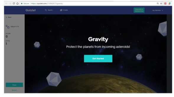
Figure 12(a). Gravity interface

Gravity offers a true gaming atmosphere as the difficulty level of the game can be set to give a challenge sensation to the students. There are easy, medium, and hard which are illustrated by the Figure 12(a) and (b).