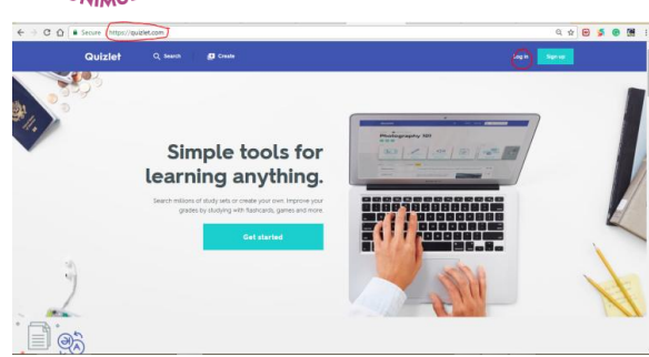
Figure 1. Access