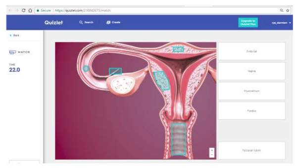
Figure 11. Match

The students learn the vocabulary through a matching game as illustrated by the Figure 11 above. The students are required to choose the correct term in accordance with the pointed picture.