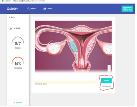
Figure 7. Write mode

This feature help improves their writing skills as the feature requires the students to write the vocabularies. The feature also offers "don't know" feature which provides the answer. Once the students click "don't know" button, the pop up will appear on the picture showing the correct answer (See Figure 7 and 8 below).