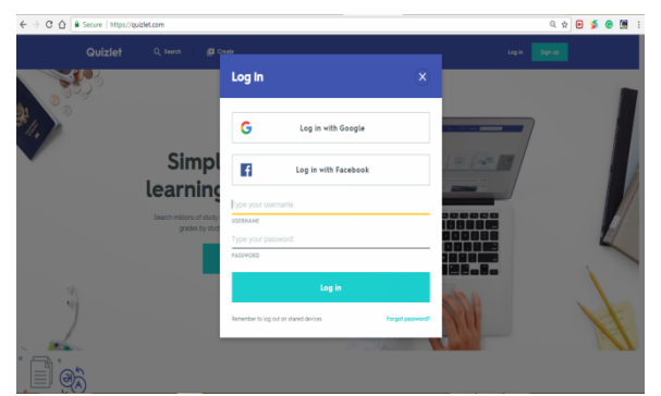
Figure 2. Log-in

Once the users click quizlet.com, the users will directly go to the app as it is shown in Figure 1 above. To access Quizlet, users are required to log-in by using the Quizlet account. Quizlet offers a sign-up feature to allow the users to create their own account. Users can also use their Google account or Facebook account to access the app (see Figure 2).