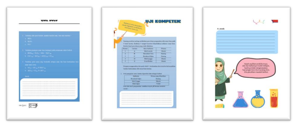
Figure 6. Evaluation page

The evaluation page is in the form of a link connected to the Google form which consists of essay questions and problem-solving to know the extent of student creativity in understanding and solving a problem.