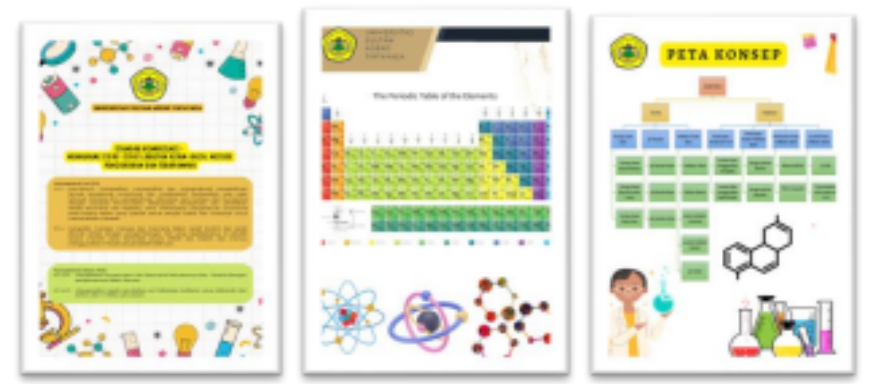
Figure 2. Competency Standards, Concept Map, Periodic System of Elements