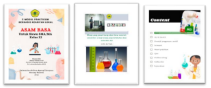
Figure 1. Cover Page, Motivation, Contents of the e-module