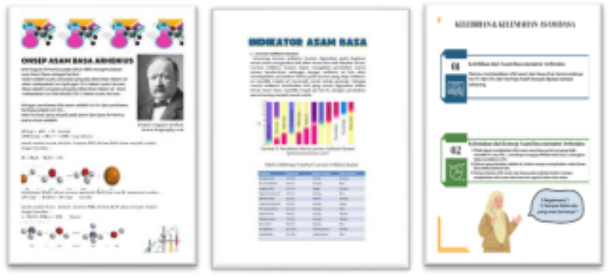
Figure 4. Lesson Material Page

The main material page consists of several applications used in the form of interactive videos, animated videos, videos of practicum activities, images of the results of practicum activities, and other images required to support the discussion of the material presented.