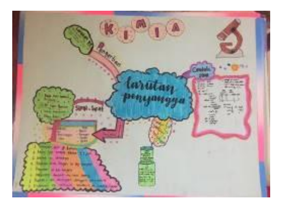
Figure 4. Mind Mapping of Buffer Solution Topic.

Efforts to determine the effect of project-based learning on student collaboration skills can be seen in table 4.