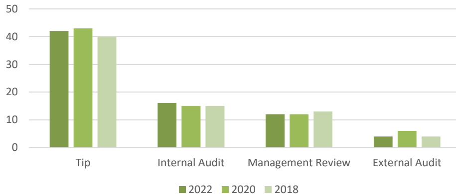
Diagram 2. Fraud Disclosure Methods (ACFE, 2018-2022)