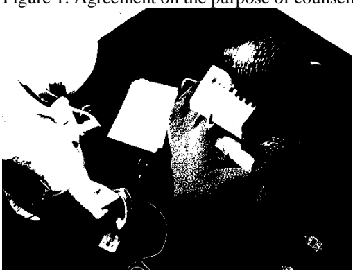
Figure 1. Agreement on the purpose of counseling

To build the strength of achievement for the counselee is realized by the counselee is very heavy. Because the problem in the counselee is low, then the other person becomes a self-fear in the counselee to excel. It is at this point that the counselee realizes that what is done has been self-defeating. The counselee realizes that the other person is not a problem for him, but it is himself who is the biggest problem in the low performance experienced so far.