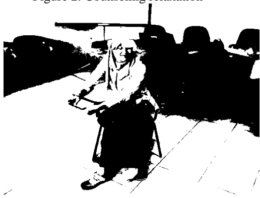
Figure 2. Counseling relaxation

The final stage of the termination meeting becomes a meaningful moment for the counselee. Changes in the mindset to continue to perform is the strength of the inside of the counselee. Without a strong determination the counselee does not succeed in counseling. Self-reliance counselee is needed to decide his life. Inner strength makes the counselee able to survive in work situations that can provide an opportunity for achievement for him. Achievements are no less successful than those who work hard for the present and future life.